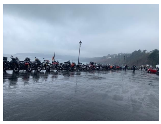
Either my pride or need to fit in made me carry on, a decision that was challenged more at the next stop.

Off we set along the east coast and north toward Ramsey, where the rain seemed to ease off but I was only taking a breather for the next step. We drove through Ramsey passing several dry welcoming coffee stops and on to Point of Ayre Lighthouse. I am sure the edifice has its appeal but on the last leg to it the puddles were so deep they exposed a flaw in my waterproof boots, i.e., the hole you put your feet in. The misery caused by the spray became apparent after the