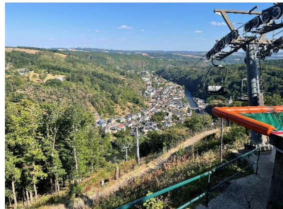
Chairlift at Vianden