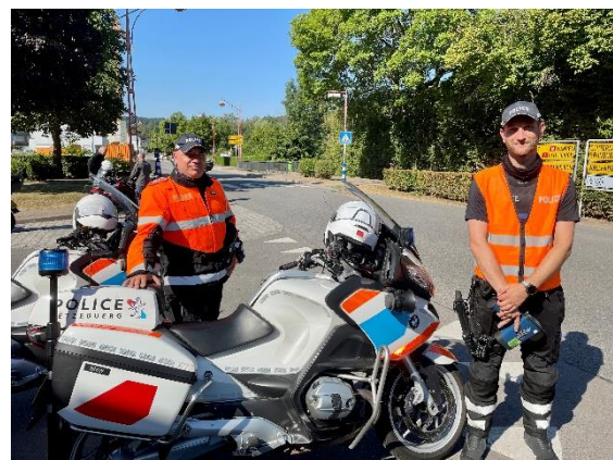
Assisting the police

The sunny, steep sided Mosel valley was covered in vines. Picturesque villages adorned the riverside. It was the hottest day of the trip and the cool of the forest on the homeward leg was most welcome as were the hairpins that marked the final descent into Vianden. A shower, wringing out the riding gear and into the bar for rehydration. The three-course dinner menu was announced once we were sat at the table. We had no cause to request an alternative but we felt that had we done so, some flexibility would be forthcoming.