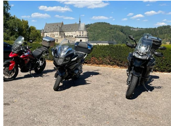
Bikes posing in front of Vianden castle

and my jacket in a cupboard while we looked around. A delightful ride