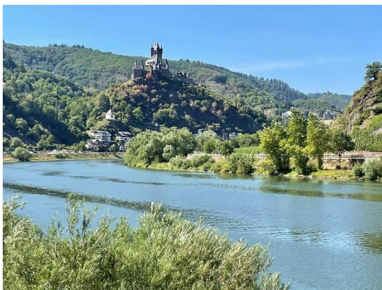
Fairytale castle at Cochem

The shop was in the industrial part of Trier; we missed the historic town with its Roman remains. I bought a pair of biking jeans and looked at mesh jackets which were either too small or monstrously large. The jeans fastened the wrong side, maybe because they drive on the wrong side I thought. There was plenty of room for my rear too. Very strange, anyway they were cool and comfortable.