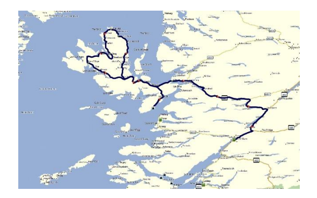
Western Highlands and Islands Day 3

couple of vantage points to take in both.