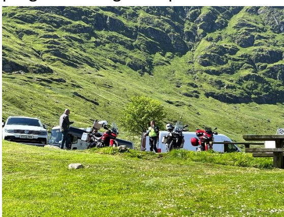
Ant on the phone at Rest-and-be-Thankful car park

It was probably amongst the woodland detritus, close to a portaloo outside Tarbet, that something sharp worked its way into the rear tyre of Ant's BM. We made progress along the planned route