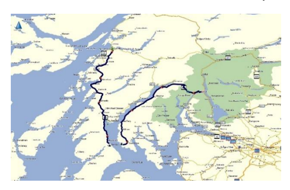
Western Highlands and Islands Day 1

Tarbert gave us the road to Oban, where we stayed the night. We'd covered around 350 miles that day.