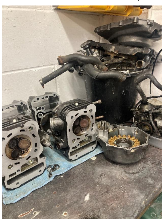
half. Everything on the engine and everything inside the engine covers needs to be removed. So that means Cylinder heads, barrels, cam shafts,

Gearboxes on bikes are simple. They are very much like mechanical 3D puzzles and actually getting to them can be hard as they are buried deep in the bowls of the engine casing which in this case need to be split in