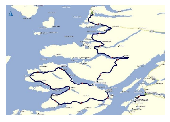
Western Highlands and Islands Day 2

On the ferry itself, there was a well manned tethering point where a couple of big Scottish lads strapped down the bikes with more care than might have been anticipated. There's something special about