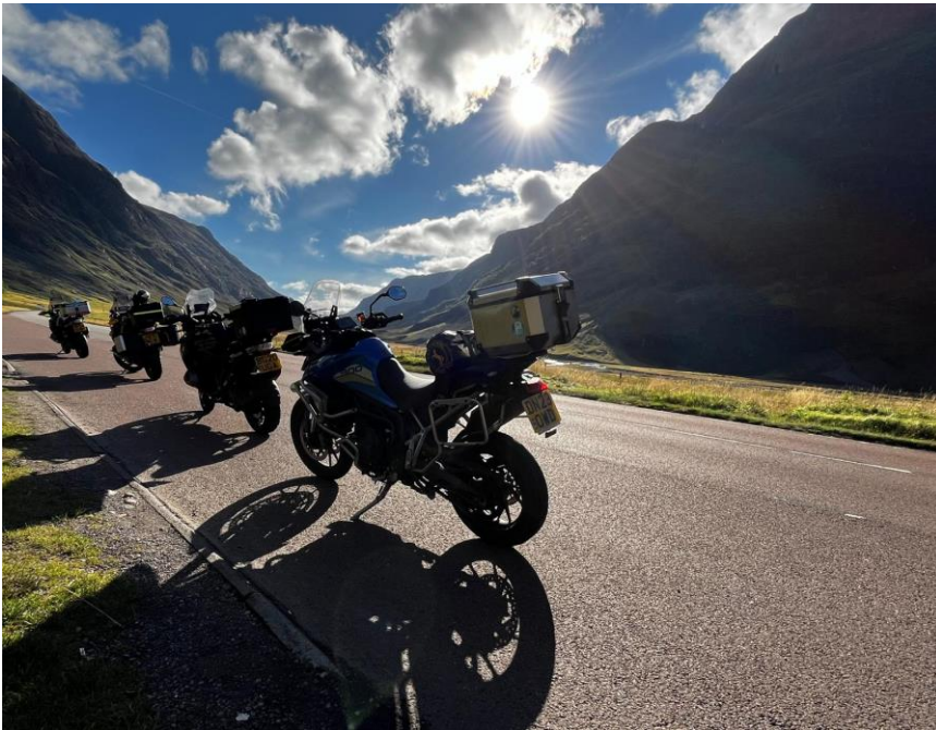
Machine and mountain in perfect harmony