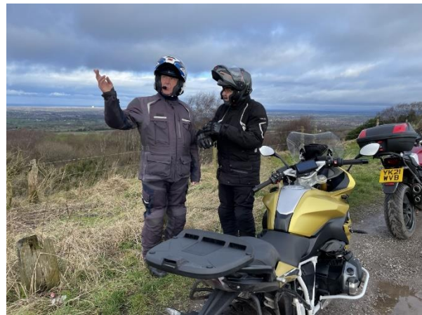
Demonstrating weather management skills