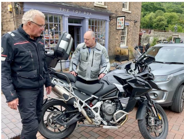
Look what I found in the Toy Box